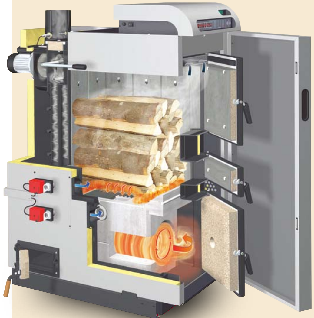
Image used for informational purposes only. Actual appearance may vary.

Kindling, tinder and paper are loaded into the Turbo 3000 followed by standard cord wood. The fire is then lit via the Ignition Port. This small access door is unique in the industry and makes lighting a fire very quick and easy. The wood gasification combustion process begins when the draft induction fan turns on and pulls fresh air into the boiler. This air is pulled into the bottom of the firebox and down through the live charcoal bed. The primary combustion that takes place in the firebox produces a hot mixture of unburned gases that are pulled down into the patented Vortex secondary combustion chamber. Simultaneously, additional pre-heated air is injected into this stream of hot gases resulting in a very hot 1800°F to 2000°F secondary burn. Only at these temperatures can a high efficiency, clean burn be achieved.