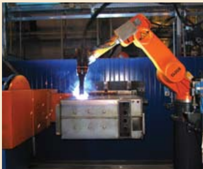
State-of-the-art robotics technology within Fröling's manufacturing plant.