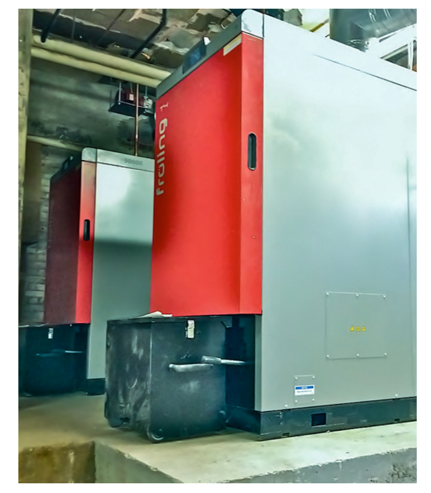
Two Fröling T4 150 wood pellet boilers