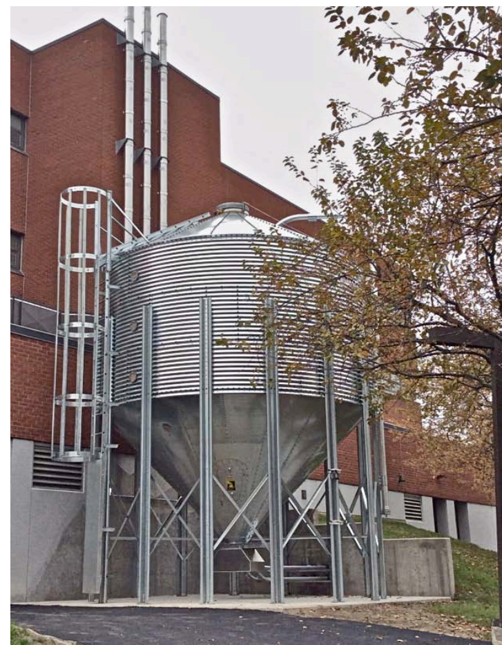
42 Ton Pellet Fuel Silo