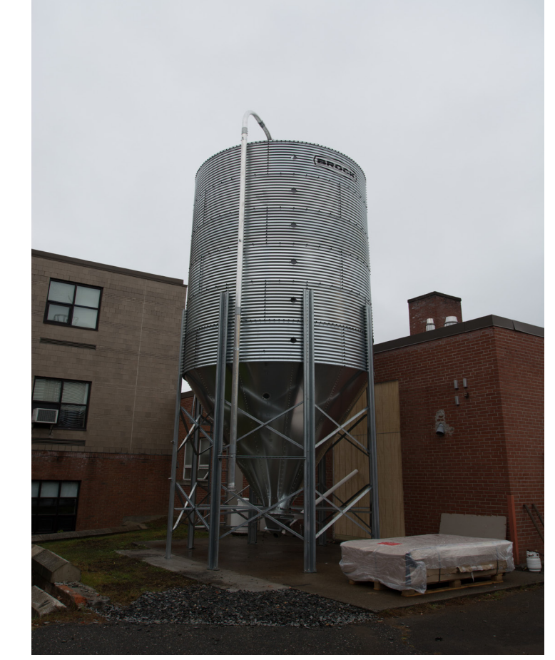
32 Ton Pellet Fuel Silo